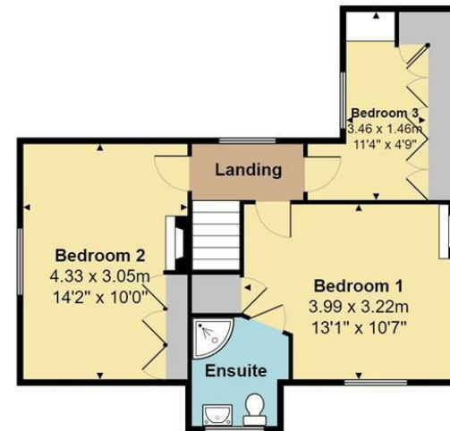
1st Floor Total Floor Area 41.5 m 2 ... 447 ft 2

Measurements are approximate, not to scale and for illustrative purposes only. www.essentialpropertymarketing.com